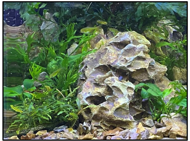
The 2023 Hobbyist Youth Best of Show winner was Layla Elder.