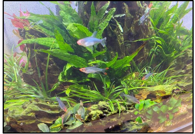
The 2023 Aquarium Beautiful Best of Show winner was Shelby Brown.