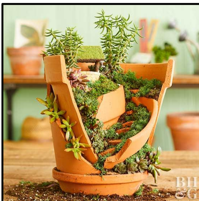
Cracked Pot Gardens