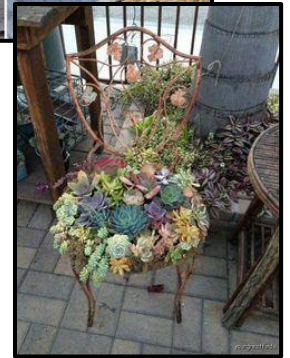
Succulents in Alternative Planters