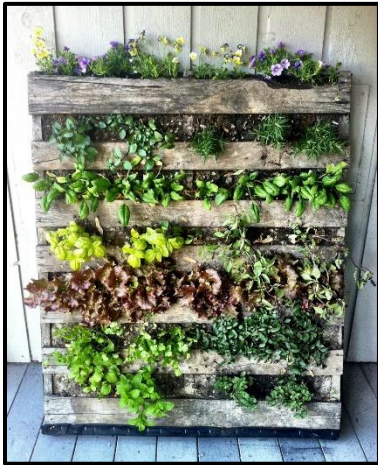
Wood Pallet Planters