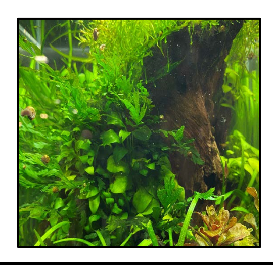
The 2024 Aquarium Beautiful Best of Show winner was Dharmesh Patel.