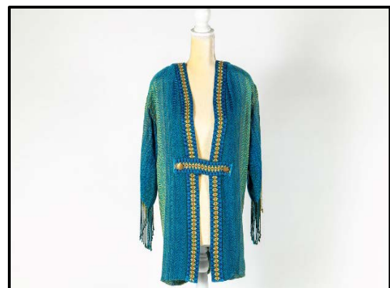
The 2024 Weaving Best of Show winner was Blythe Batten.