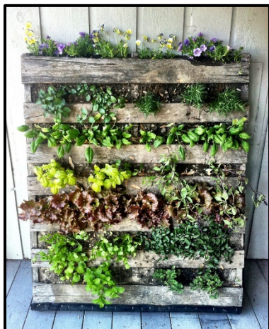
Wood Pallet Planters