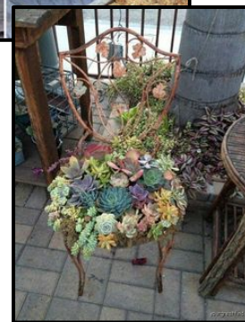
Succulents in Alternative Planters