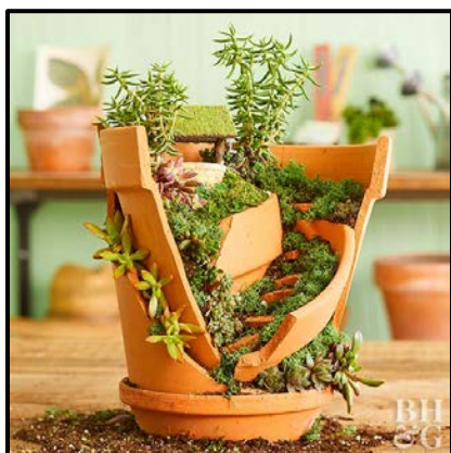
Cracked Pot Gardens