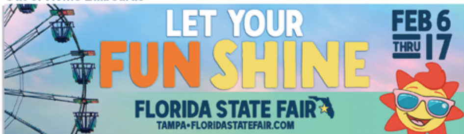
Out of Home Billboards