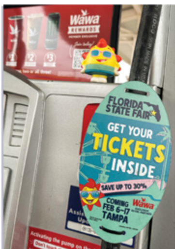
Wawa Retail POS