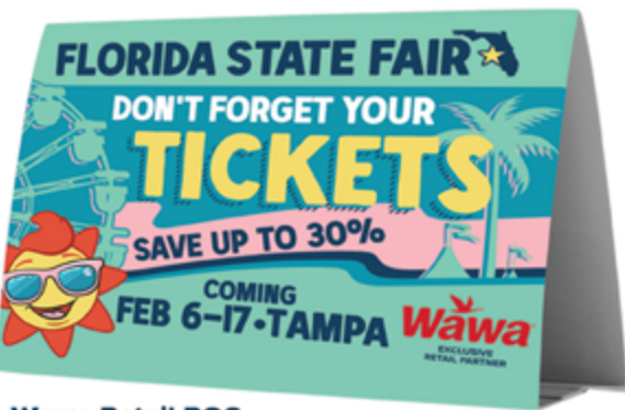
Wawa Retail POS